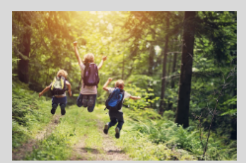
Surround Yourself With Nature