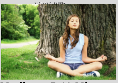
Meditate 5-10 Minutes